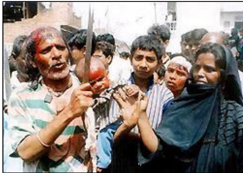
A Shiite Muslim couple hold their baby while cutting the forehead during the religious rite of Ashoura as part of Muharram in Lucknow on Monday.