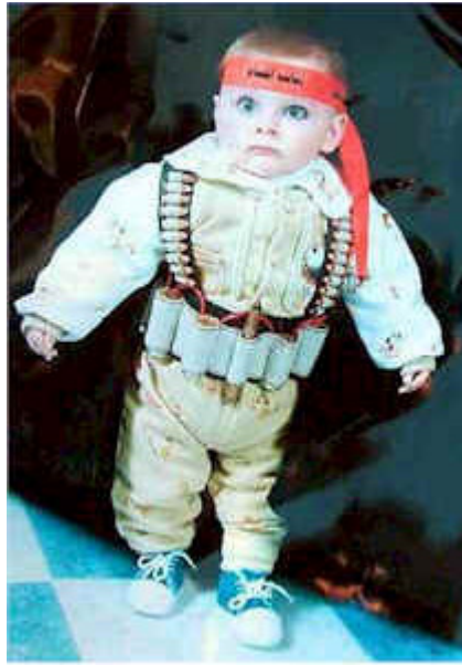
Palestinian Toddler in a suicide bomber's vest and a red Hamas headband. Photograph found by Israeli soldiers at a home in Hebron was said by family of the child to be a "joke"