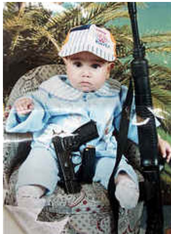
Palestinian baby in Hebron.