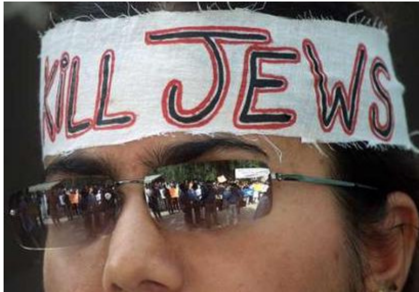
A Muslim Pakistani student wears a headband with the words 'kill jews,' during an anti-war rally at a university in Islamabad, March 26, 2003. The students of Quaid-i-Azam University gathered on Wednesday to protest against the U.S.-led war in Iraq - More Peaceful Muslims .

❏ Be Careful who you Call a Kafir - The fastest way to leave Islam is to wrongly call another person a Kafir. Waste no time debating what a good Muslim should be. Be one!