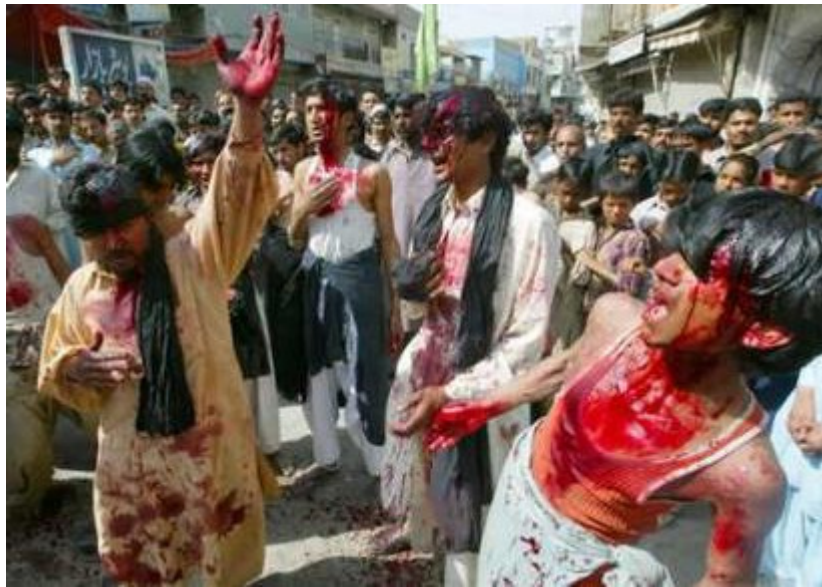
Pakistani Shiite Muslims felicitate themselves with knives during a religious mourning procession in Rawalpindi, near Islamabad, March 14, 2003. The tenth day of the first month (Moharam) of the Arabic lunar year, also known as Ashura, is observed with processions and prayers throughout South Asian Muslim countries. Ashura commemorates the anniversary of the death of Hazrat Imam Hussain, the grandson of Prophet Mohammad, killed along with his 72 companions more than 13 centuries ago in a battle in Iraq.