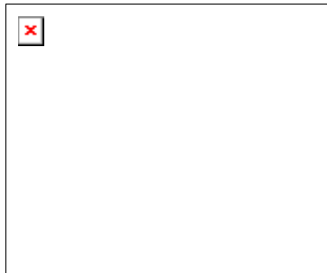
An Arab mother turns words into deeds by training her son as a PLO suicide bomber